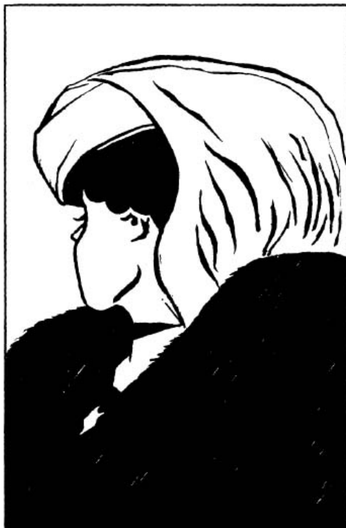
Figure 3 Ambiguous picture, first drawn by cartoonist W.E. Hill in 1915 and reprinted in the psychological literature by Boring (1930). It can be viewed as a head-and-shoulders portrait of either an old woman or a young woman. (If you have difficulty seeing both, it might help to know that the old woman is in profile and looking to the left; the young woman, also looking left, is turned away from the viewer. The old woman's left eye the young woman's left ear. The old woman's mouth is the young woman's necklace. The old woman's nose and nostril are respectively the young woman's cheek and jaw.)

One of the ways in which understanding develops is by trying to work out the structure of what is being communicated, so that we can see what the relationship is between the different parts and make sense of the whole. As Laurillard has commented, 'The same information structured differently, has a different meaning' (Laurillard, 1993). We all know for example, the 'catch' drawings where we can see the same pattern of dots and lines two ways, depending on the structure we give it. Figure 3 is an example. It can be seen either as a young girl or an old woman, depending on which structure we impose on the information.